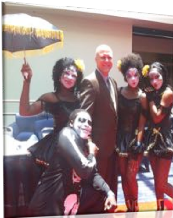
ESSENCE Festival 2011

In addition to performing professional dance-acts at festivals and other events the Baby Doll Ladies work to cultivate the masking, music and dance traditions that make up the essential qualities of community-based Mardi Gras. The Baby Doll Ladies Walking Parade creates new knowledge to a wider audience and frameworks for reinterpretations of existing historical documents.